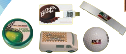
Ad Specialty Items